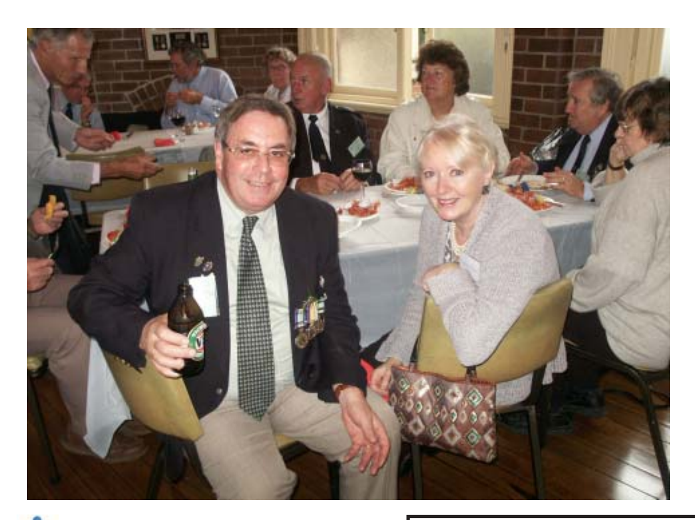
JULY 2007 Notice To Mariners page 9